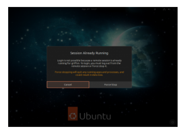
Click on Picture for better Resolution

The only problem is that if you click Force Stop button, it seems not to work. The remote session is not killed. We have not tried this on older Ubuntu releases but I think this is because of the gnome-remote-login addition in Gnome 46 .