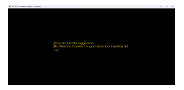
Click on Picture for better Resolution

If a user is logged on locally and if the same user tries to perform a remote connection to the machine, the user will get informed about an existing session already running as shown in the screenshot below